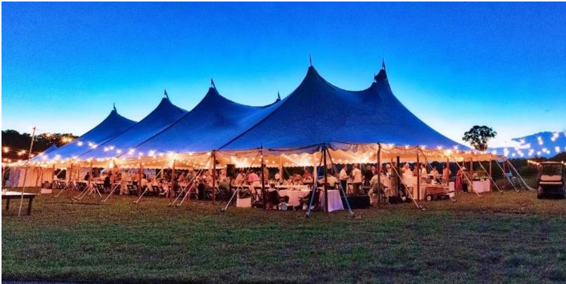
Dinner at Dusk