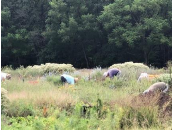
Weeding is back bending work

our partners, sponsors and friends. They also prepared other sections of the gardens by planting in the Woodlands and along the Woodland boarder.