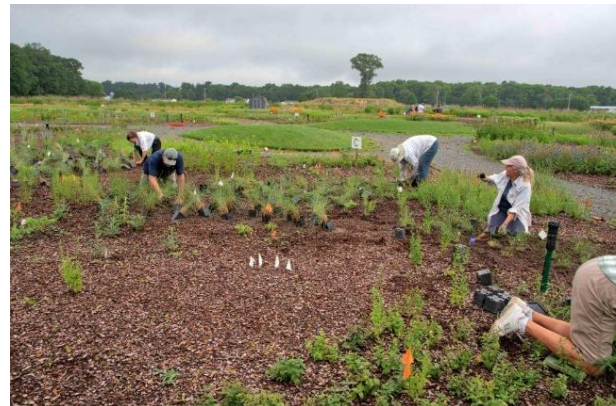
Garden Stewards planting in Meadow Garden