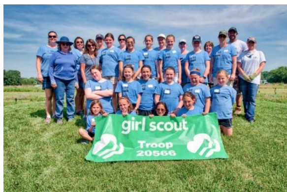
Troop 20566 and adult leaders