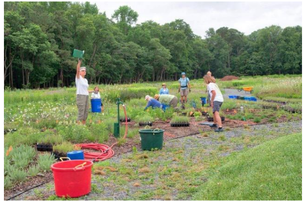
Volunteers positioning plants in Meadow Garden