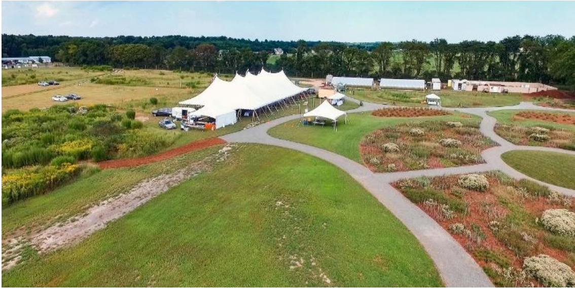
The Garden is ready for guests